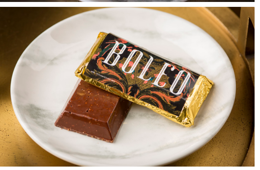
Peruvian Crunch Bar Illanka Peruvian chocolate, puffed quinoa, cayenne