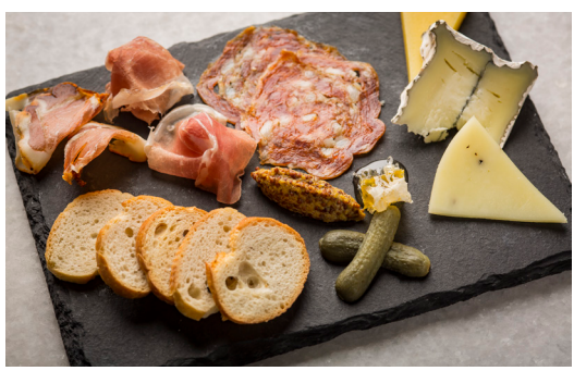
Charcuterie & Cheese Plate assorted Creminelli cured meats, seasonal cheeses, honeycomb, grain mustard, cornichon