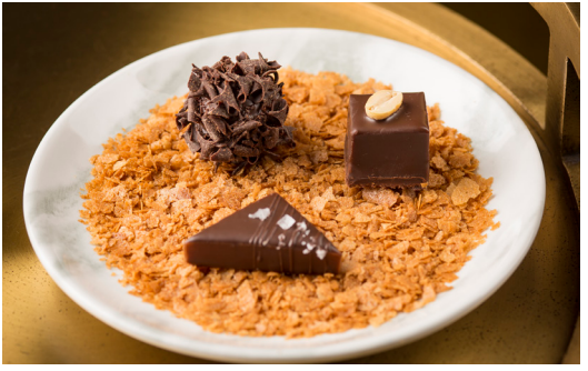
Chocolate Trio sea salt & caramel chocolate, double-chocolate truffle, peanut butter & jelly chocolate