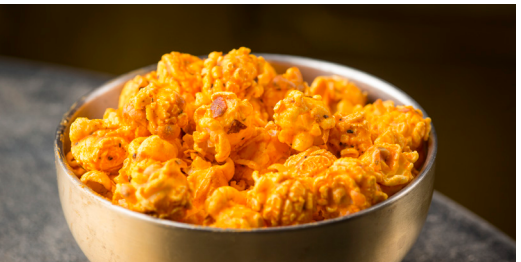
Boleo Popcorn spicy three chili & cheddar