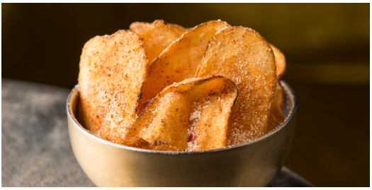
Deep-Dish Potato Chips pizza seasoning, parmesan, chili flakes