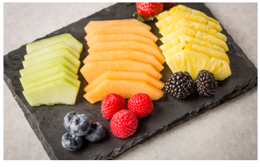
Sliced Fruit Plate seasonal sliced fruit & berries