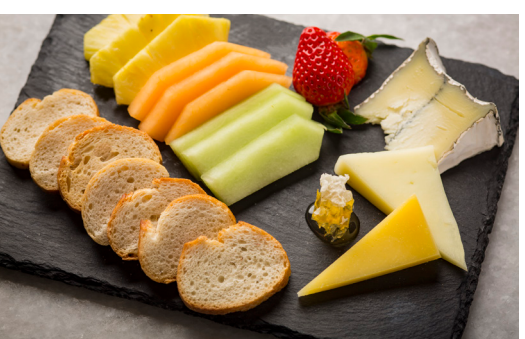
Artisan Cheese & Fruit Plate seasonal cheeses, sliced fruit, strawberry, honeycomb, crostini