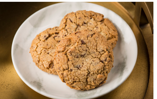
Chocolate Chip Cookie Platter Chef Mallory's original shredded chocolate recipe