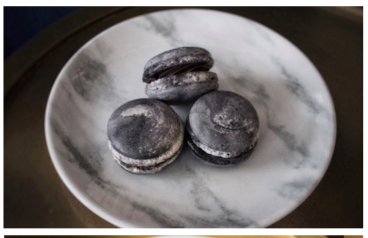
Vol. 39 Gray Macaron bourbon dark-chocolate ganache, orange-cherry angostura bitters gel